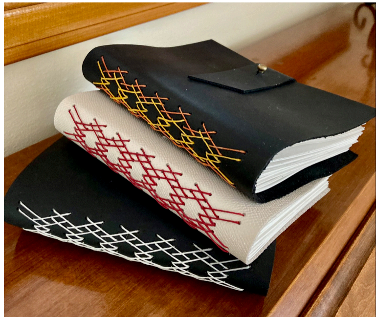
Handmade books

While I don't have a website (yet), I am planning on opening an Etsy shop for my books. Look for an October opening. I'll be very open to feedback as it will be a new gig for me.