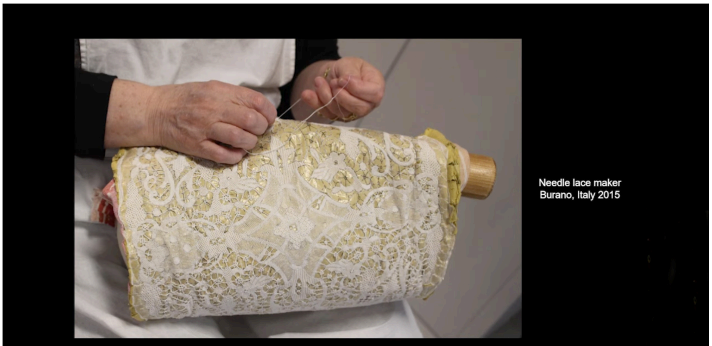
Needle lace maker Burano, Italy 2015

All about the origins of the Metropolitan Museum's Lace Collection, which now numbers over 5000 items and was begun in 1879 as the Met's first textile collection.