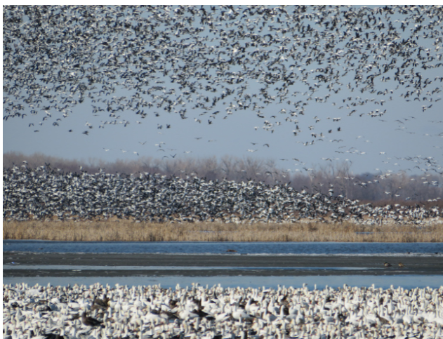
One million geese day at Loess Bluff

clothes in high school. I won a couple of high school art contests with my tailored pieces. I knew I wanted to take art classes in college but it was difficult to find the right medium at the right college. I ended up at Pittsburg State University and before I enrolled, walked around the art department for inspiration. As I entered one of the classrooms, I spotted two looms in the back and had an instant life-changing epiphany - "Why not create my own fabric?" I don't think I had ever seen a floor loom prior to that. A lifetime of fiber art bloomed from that one moment.