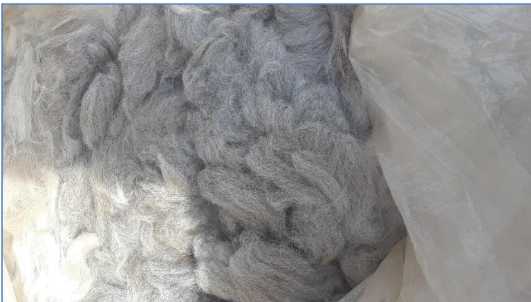
grey white mix